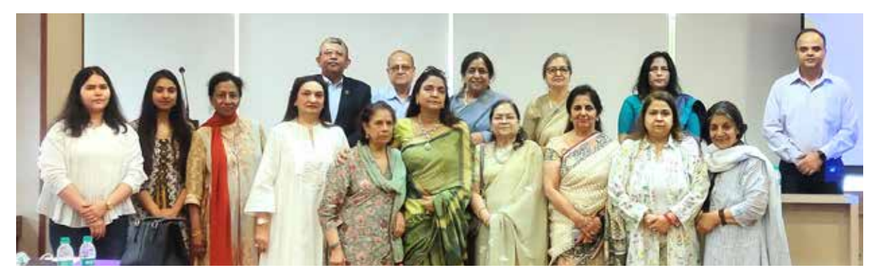
he Governing Body Meeting of the PHD Family Welfare Foundation was held on November 23, 2021 through virtual platform and on May 9, 2022 at PHD House, New Delhi. The Foundation's previous activities, details of projects and action plan were reviewed and discussed in the meeting.