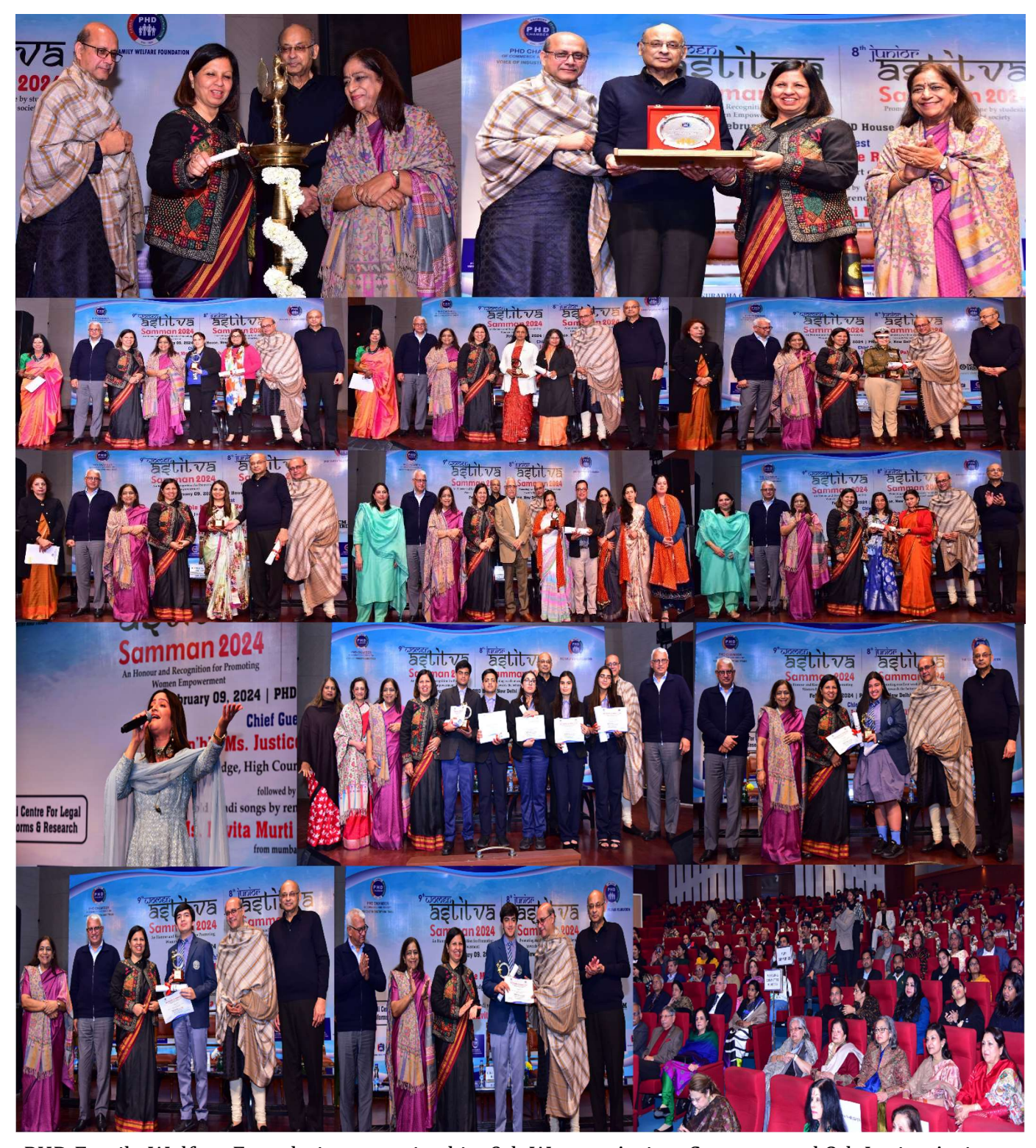
PHD Family Welfare Foundation organized its 9th Women Astitva Samman and 8th Junior Astitva